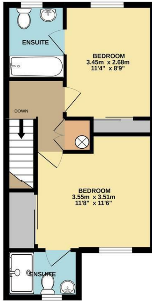
1ST FLOOR 36.2 sq.m. (390 sq.ft.) approx.